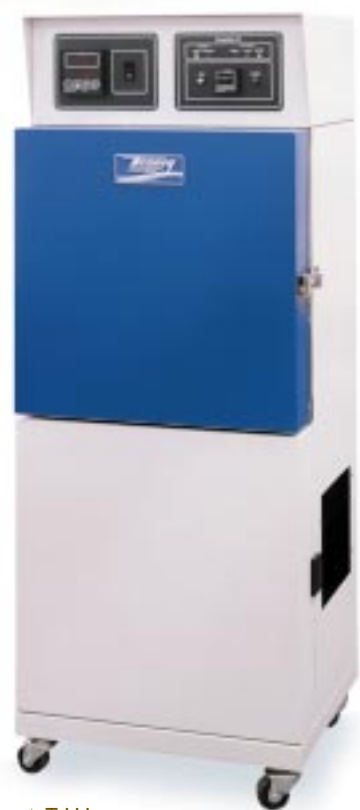
▲ T-U Jr. temperature test chamber provides maximum performance with a minimum footprint.

All wiring complies with NEC. Circuit breakers are used throughout the electrical system and are located, along